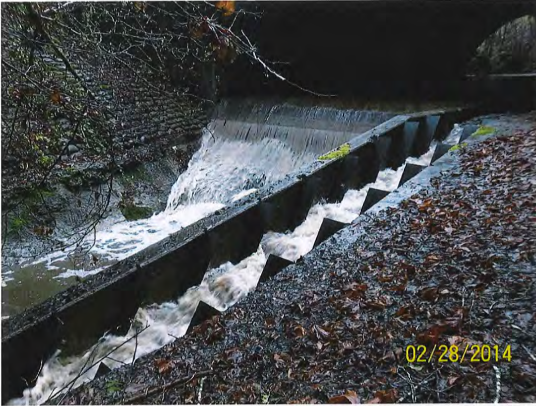
Photo 8) February 28 th , 2014. Looking upstream at culvert outlet and the top of the fish ladder.