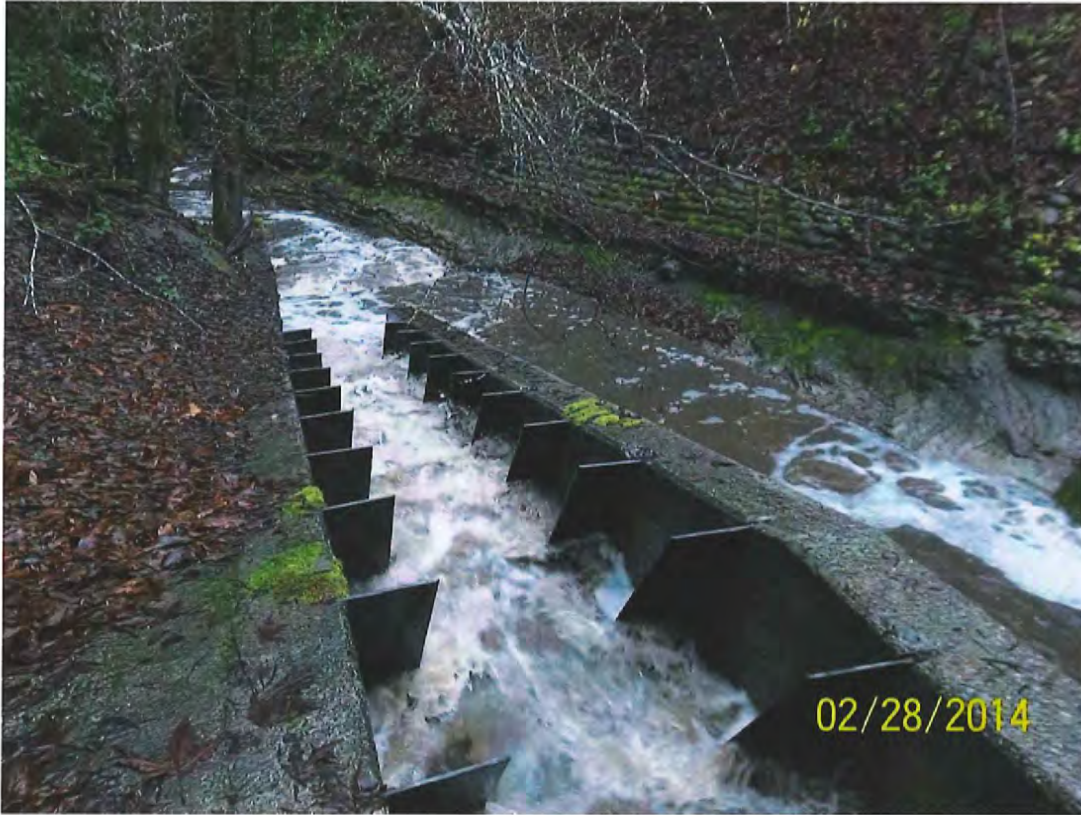
Photo 9) February 28, 2014. Photo looking at inlet to fish ladder.