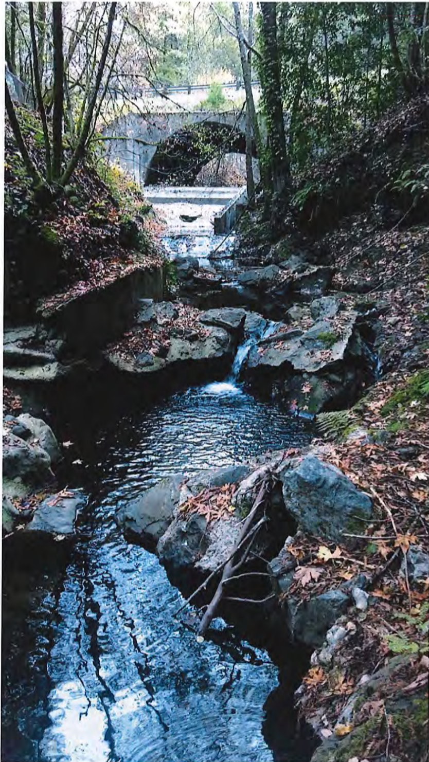
Photo 5 ) November, 18 th 2014 (During extremely low flow drought conditions). Looking Upstream at the three failing boulder weirs and the road crossing, culvert and apron, and fish ladder in the background.