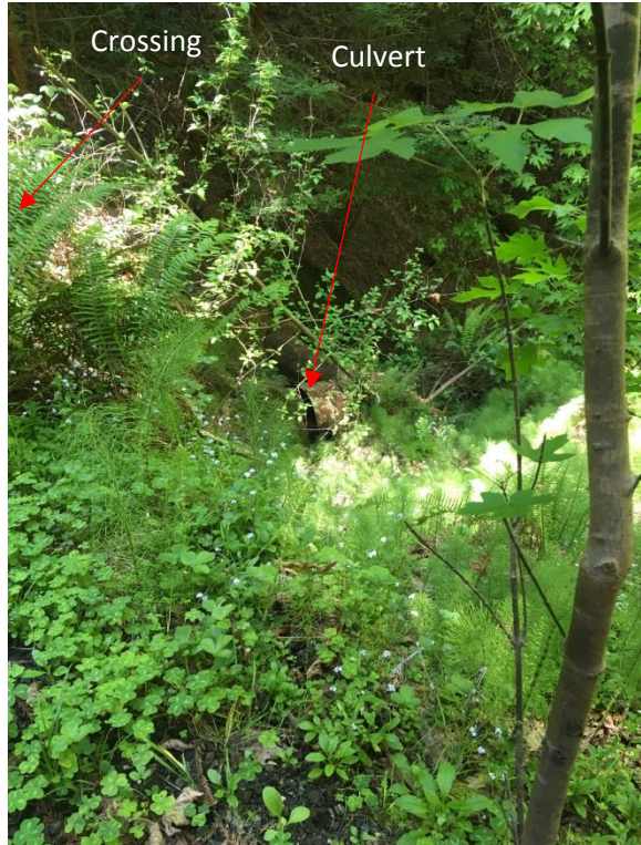
Right: Cracked and failing culvert downstream of Keystone Creek crossing