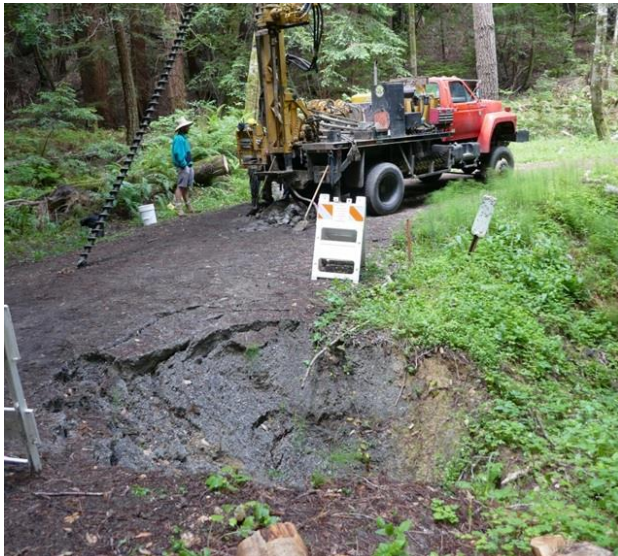
Above: Failing crossing at Harwood Creek.