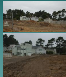
Pasture Rehab – to better manure management