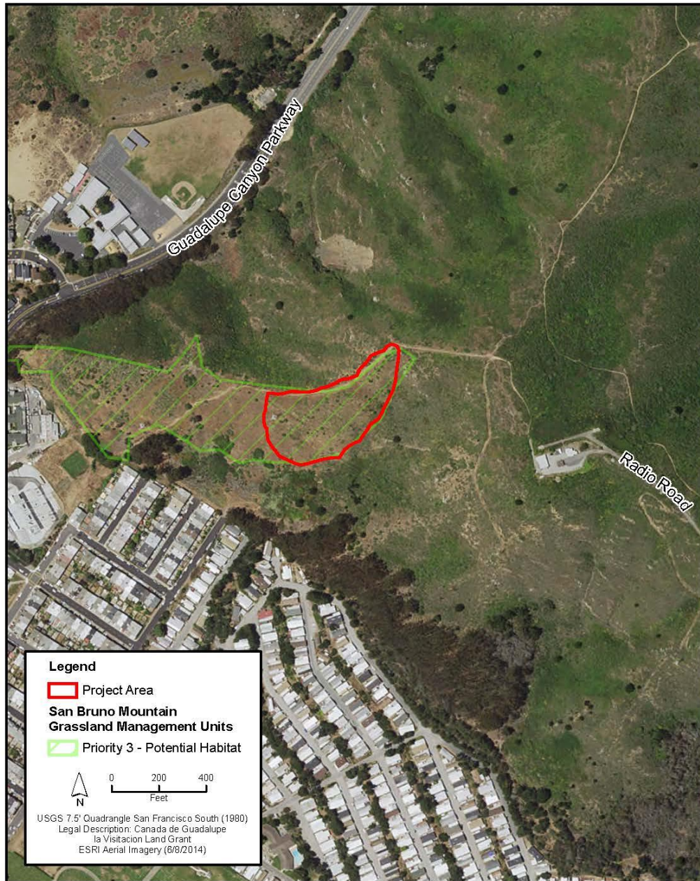
Figure 2. Grassland Management Units West Peak Restoration Project