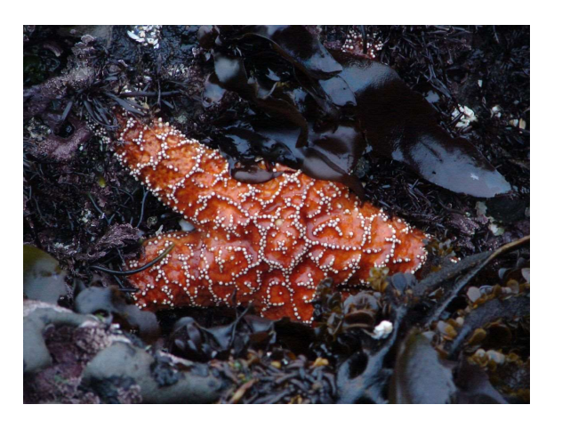
Fitzgerald Marine Reserve Pollution Reduction