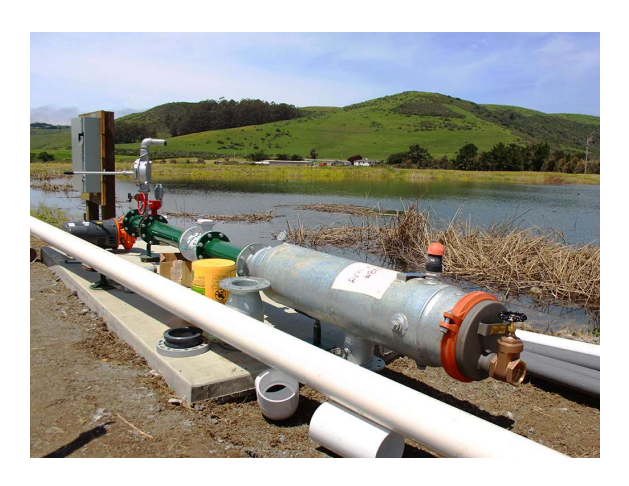
Water for Farms, Fish and People