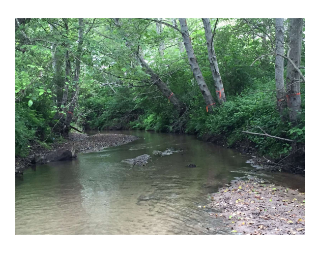
Butano Creek Floodplain Restoration