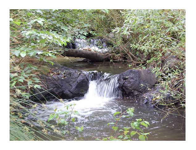
Creek Habitat Enhancement