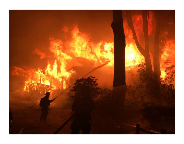
Forest Health and Fire Resiliency