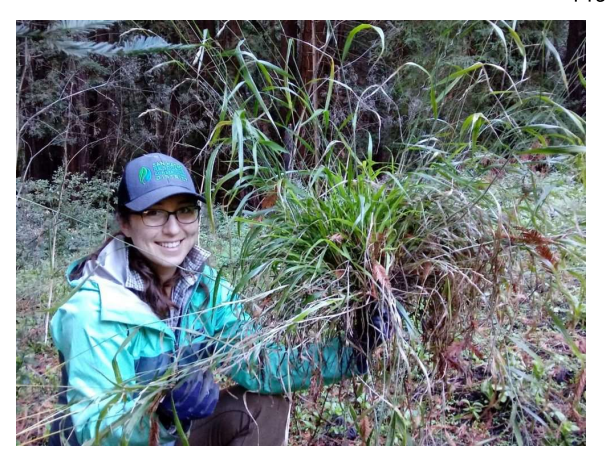
Weed Management Programs