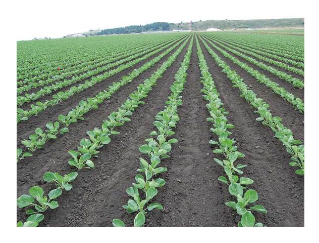
Biochar Field Trials