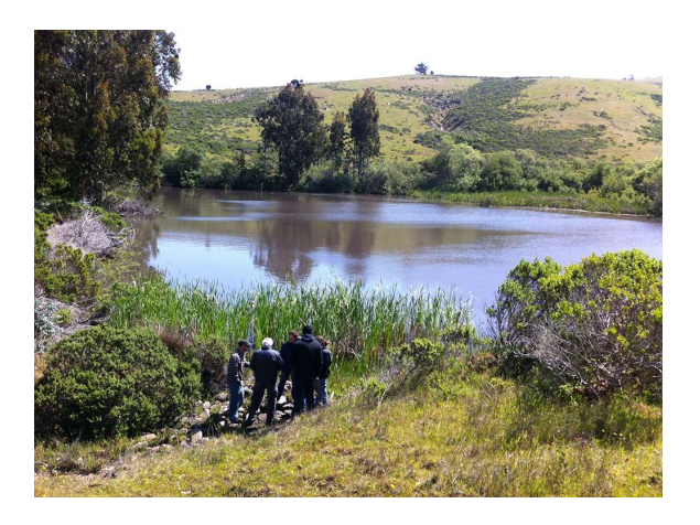
100 Ponds Project

The RCD provides comprehensive, integrated services for all aspects of natural resource management tackling these priorities in San Mateo County. Below is a partial list of our efforts. Check back soon, as this information is updated regularly.