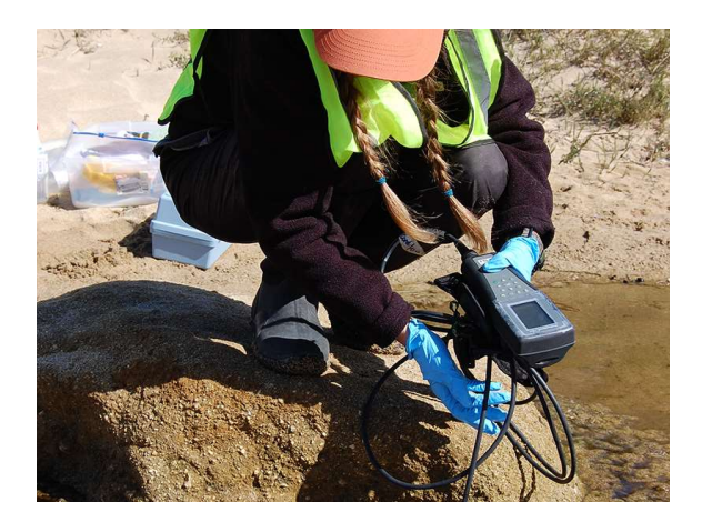
Water Quality Program