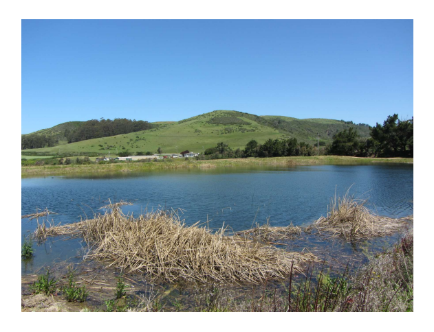
Butano Creek Reconnection