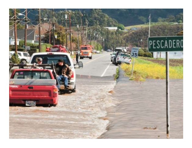
Pescadero Flood Reduction & Habitat Enhancement