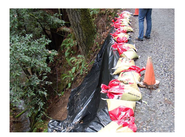
Rural Roads Program