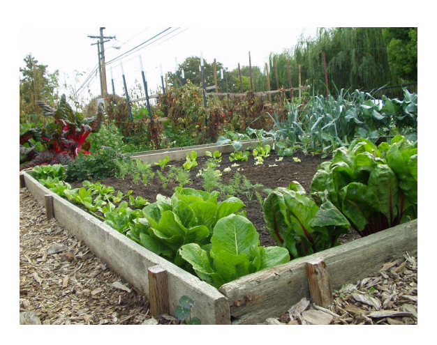
Urban Agriculture Program