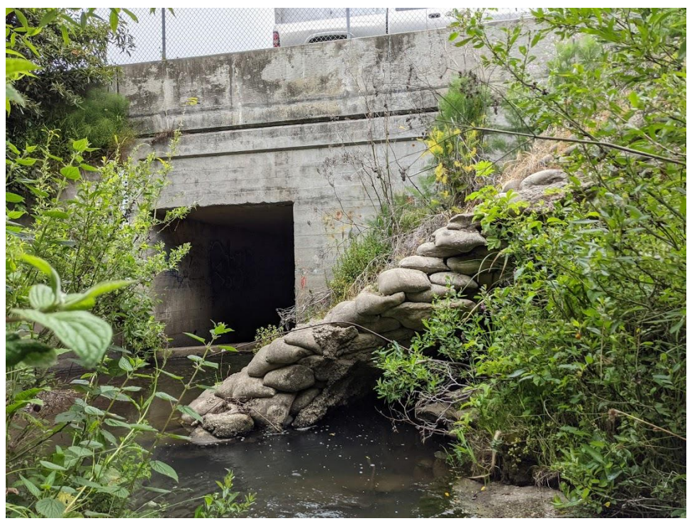
Photo 1: Adobe Bridge culvert inlet and failing sac-crete revetment (May 2021).