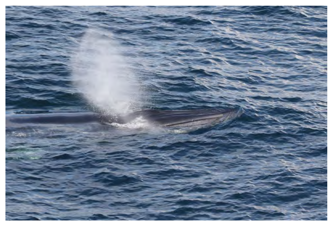
A Rice's whale (Balaenoptera ricei) surfaces in the Gulf of Mexico.

This report summarizes efforts to recover all domestic species under NOAA Fisheries' jurisdiction. It highlights progress made towards recovery of nine critically endangered species identified in the Species in the Spotlight initiative.