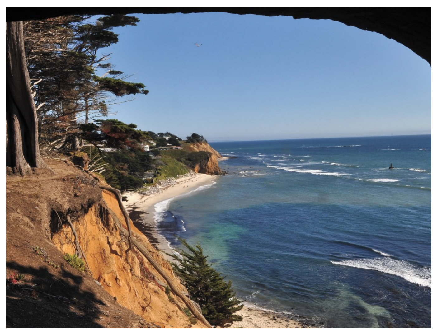
The view of the coastline southward from atop the bluffs at Fitzgerald Marine Reserve, one of San Mateo County's most treasured beaches.

Some of the Bay Area's most heralded coastline is infested with fecal bacteria. No one really knows why or what to do about it.