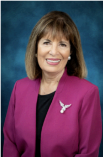
District 1 Jackie Speier