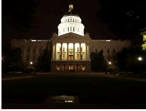
California legislature returns amid homeless, climate crisis

Newsom backs dam-removal projects aimed at sustaining salmon populations